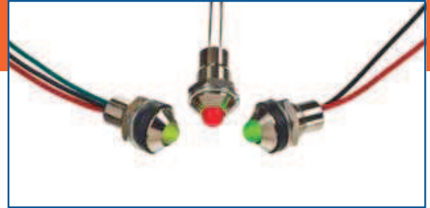
5mm Panel Mount LED Assemblies