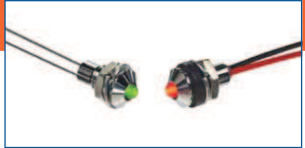
3mm Panel Mount LED Assemblies