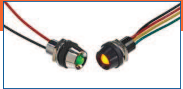
5mm Panel Mount LED Assemblies