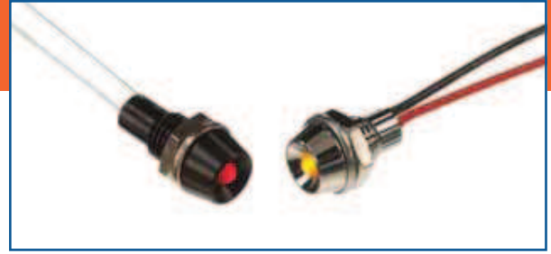
3mm Panel Mount LED Assemblies